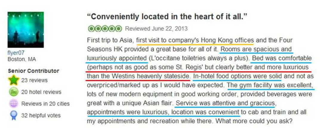
Fig. 2 A hotel review example from TripAdvisor (note that the blue underline marks feature opinions , the red underline marks comparative opinions , and the yellow underline marks contextual information ).

In this section, we summarize the valuable information that can be extracted from reviews and used to enhance the above-mentioned standard recommending approaches. Indeed, although the raw review information is in un-structured, textual form that cannot be easily understood by the system, the advances in the field of topic modeling and opinion mining (also called sentiment analysis) make it possible to interpret reviews and extract useful elements from them (Blei et al 2003; Liu 2012; Pang and Lee 2008; Snyder and Barzilay 2007). We list these review elements and briefly describe how they have been used in review-based recommender systems. Details about the related studies are given in the relevant sections.