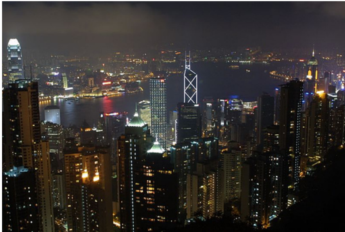
“Night scene in Hong Kong in Summer”