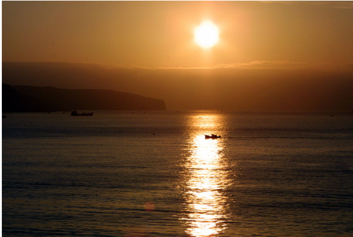
“Sunset by the sea in New York in Autumn”