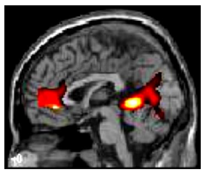
Figure 1. Brain regions whose reduced magnitude of activity predicts relapse in recovering stimulant addicts using fMRI, from [1].

work has included both the brain basis of healthy human cognition, primarily perception, attention and memory, as well as differences in brain organization associated with psychiatric illnesses such as addiction and schizophrenia, and neurological disorders such as traumatic brain injury, stroke and Huntington's disease, among others. We have found that imaging can predict relapse in recovery from stimulant addiction with up to 80% accuracy [1] (Figure 1). Through the efforts of our laboratories and others, neuroimaging has made great strides in understanding the brain basis of healthy cognition as well as neurological and psychiatric illness.