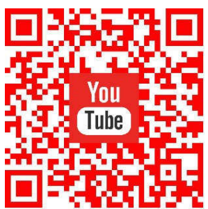
See what past Incoming students think about their experience at our University!