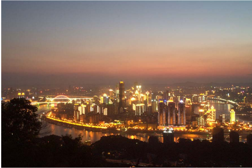
Chongqing night view