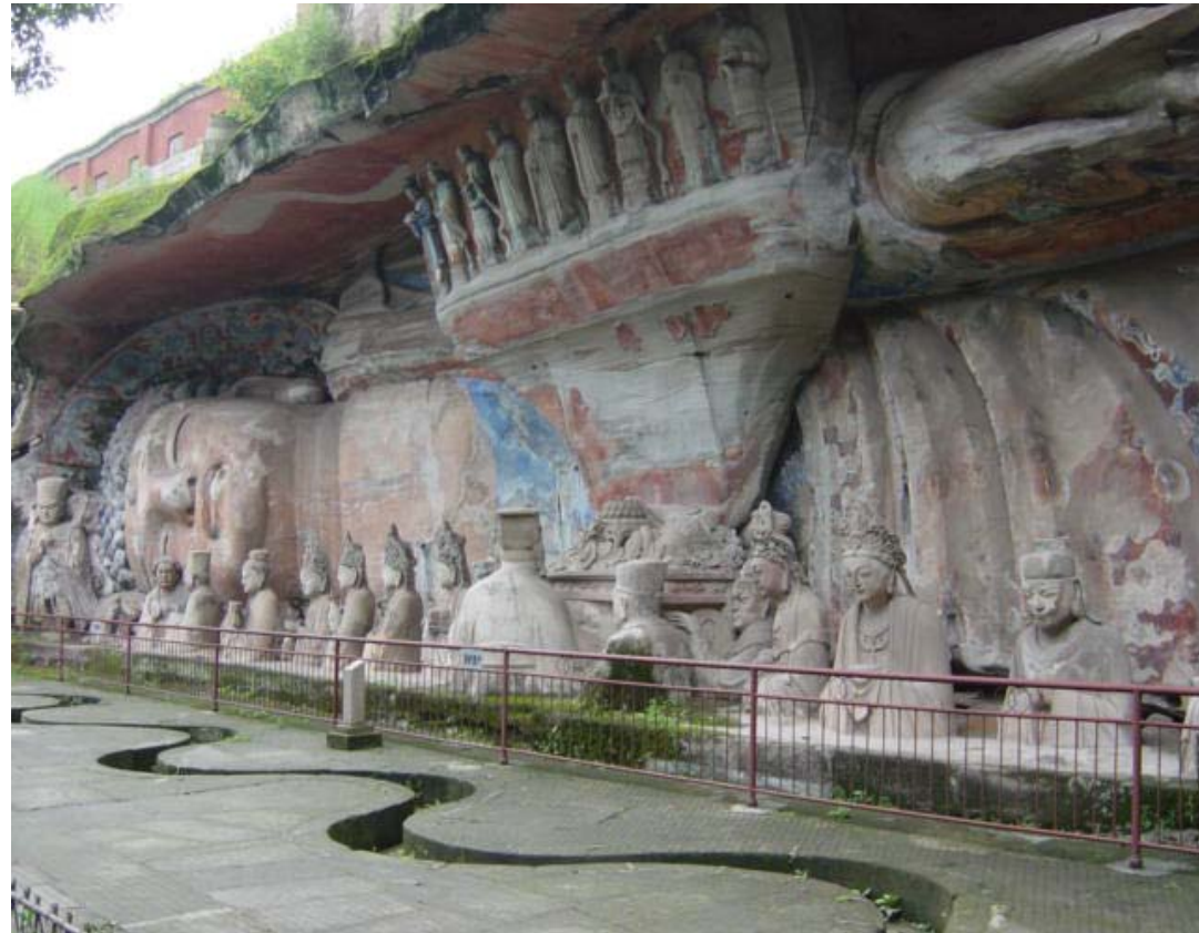
The Dazu Rock Carvings