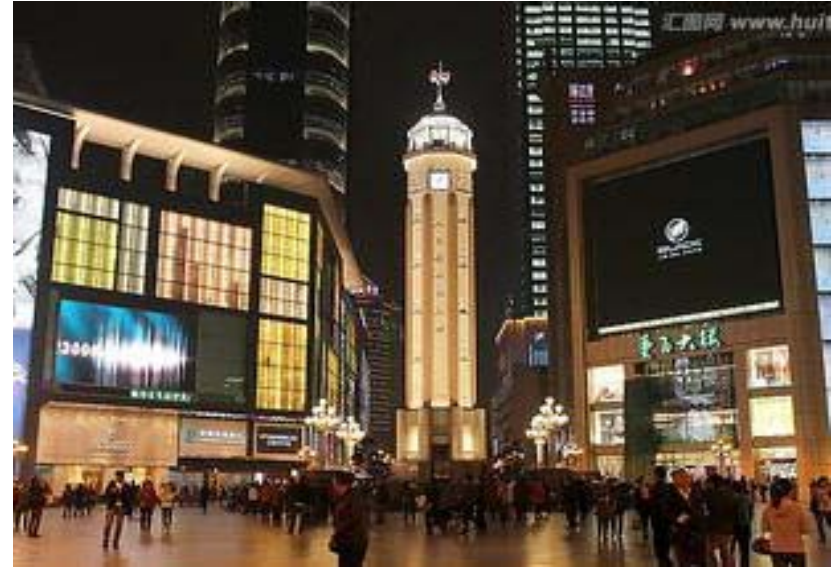
Jiefangbei night view